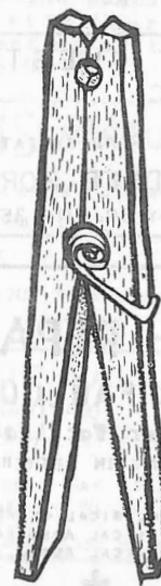
CLOTHESPIN: Primitive device for fastening wet, heavy clothing to a line during the long drying process.